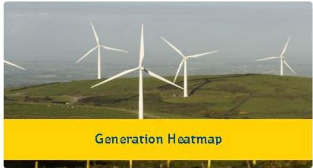
FIGURE 1: DEMAND HEATMAP AND GENERATION HEATMAP SELECTION OPTIONS